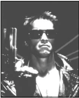
I'll be Back!

Saturday & Sunday's 10:00 am to 6:00 pm Wednesday (D.S.T) 3:00 pm to 7:00 pm